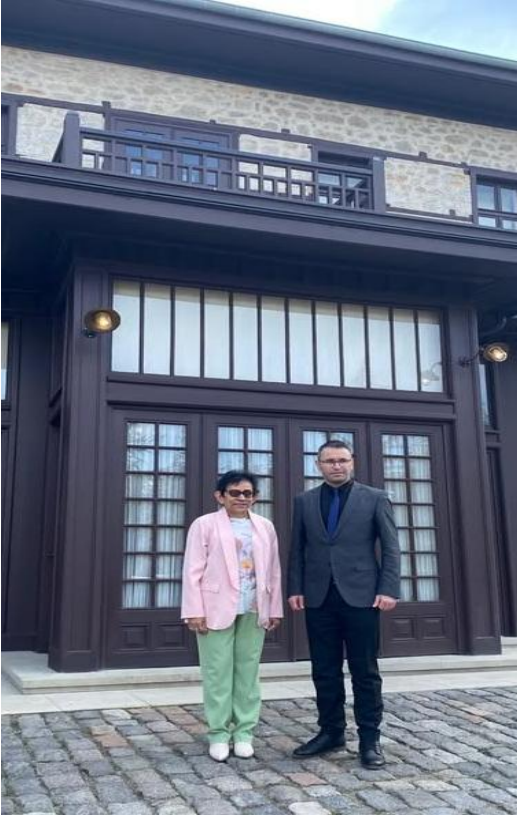
Participating in a programme: "Foreign Affairs Vocational Training: Being a Diplomat in Foreign Affairs", Üsküdar University, Istanbul - 26/02/2025.